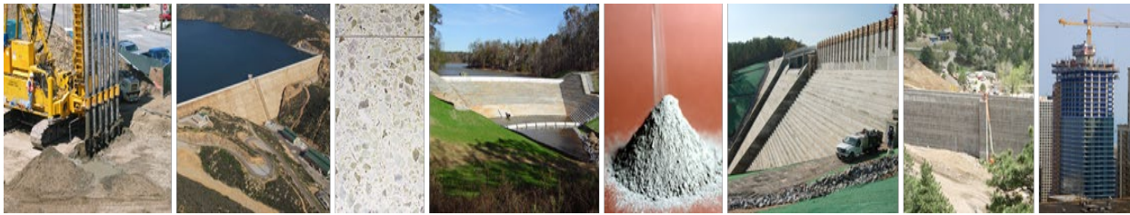
PCR for Portland, Blended, Masonry, Mortar, and Plastic (Stucco) Cements v3.2

cement, masonry: A hydraulic cement manufactured for use in mortars for masonry construction or in plasters, or both, which contains a plasticizing material and, possibly, other performance-enhancing addition(s). (ASTM C219)