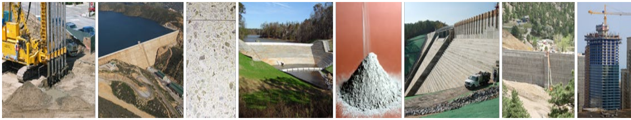
PCR for Portland, Blended, Masonry, Mortar, and Plastic (Stucco) Cements v3.2